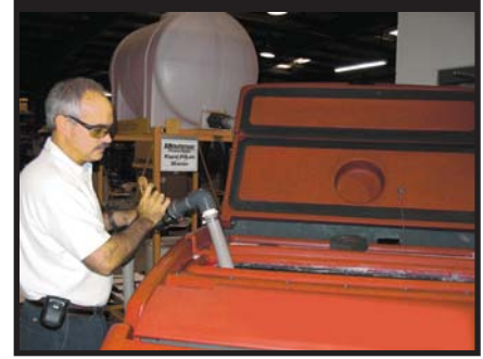
Optional Rapid Fill Station available, helps refill solution quickly