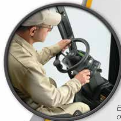
Excellent operator comfort