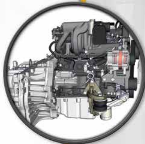
Two engine and two transmission selections are available