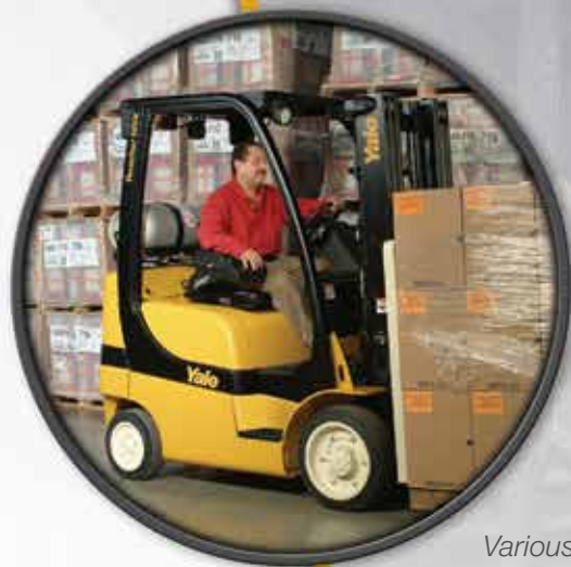
Various truck configurations

The CSS™ feature enhances the truck's lateral stability with a simple, maintenance-free design that allows travel over various surfaces.