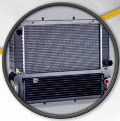
100% shock-mounted radiator